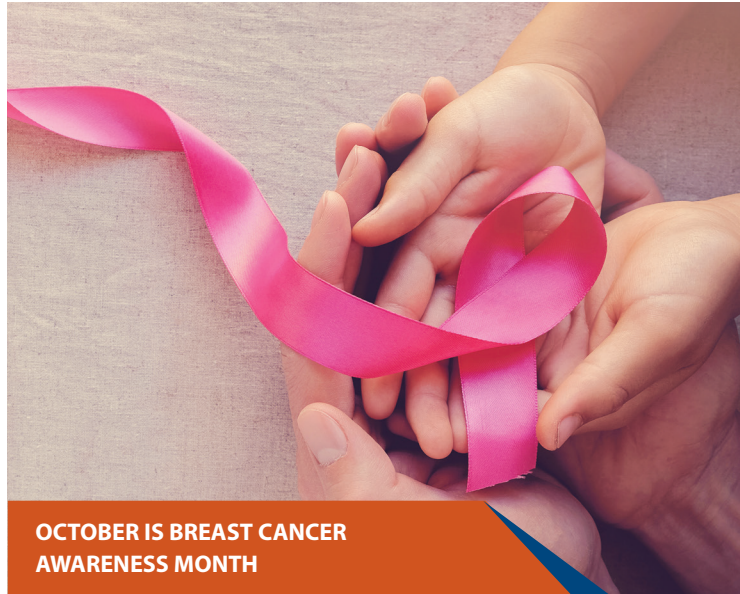
OCTOBER IS BREAST CANCER AWARENESS MONTH