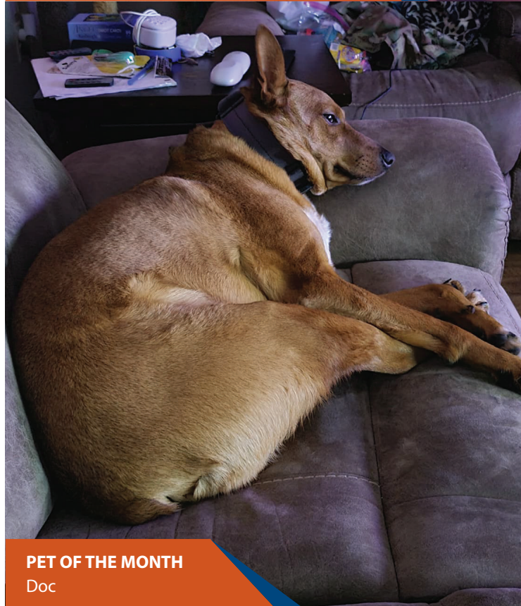
PET OF THE MONTH Doc